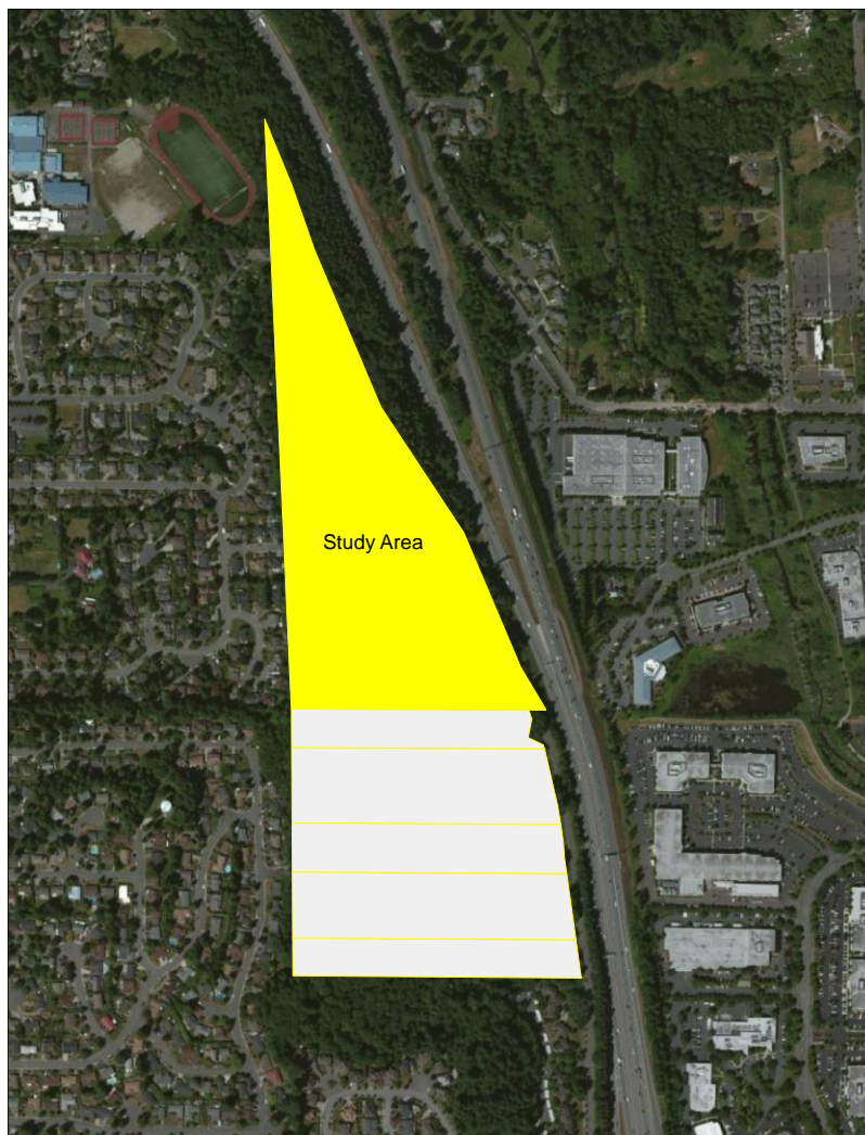
Figure 1. Parcel boundaries of the North Creek Forest and study area (Image resources: ESRI, Bing Maps, City of Bothell).

The vegetation communities in this map were created and delineated in the field using subjective judgments. Community boundaries were smoothed in GIS to accommodate reasonable visual representation and thus boundary locations are approximate. No quantitative data were gathered on plant species and thus the vegetation communities should be considered preliminary. The vegetation communities used follow the U.S. National Vegetation Classification scheme or the Washington Natural Heritage Program Puget Trough Plant Associations, or a modification of these to accommodate patterns seen during the field mapping.